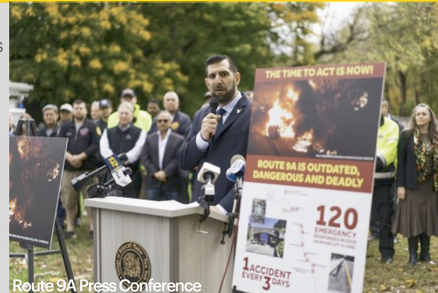
Route 9A Press Conference

A second initiative led by the Mayor is the current condition of Route 9A ... a heavily car and truck trafficked north/south road which runs through the heart of Briarcliff Manor splitting neighborhoods and our Business District. Officially designated as the Peekskill/Briarcliff Parkway, this early 1930’s construction is obviously dated in its construction, road conditions/limitations